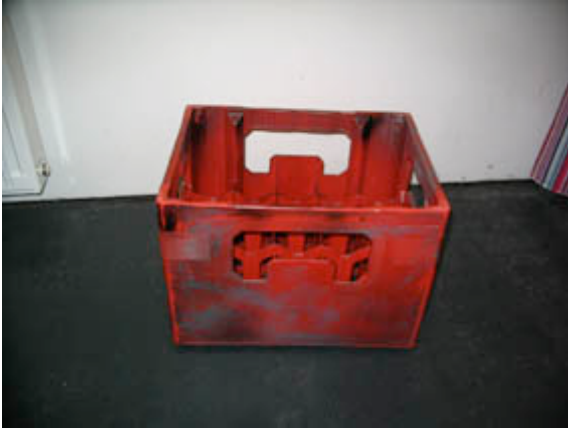
Model for the beer-crate (Bierkiste)